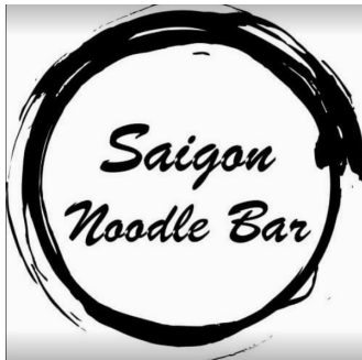
Saigon Noodle Bar