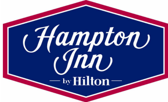
Hampton Inn & Suites