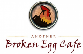
Another Broken Egg Cafe